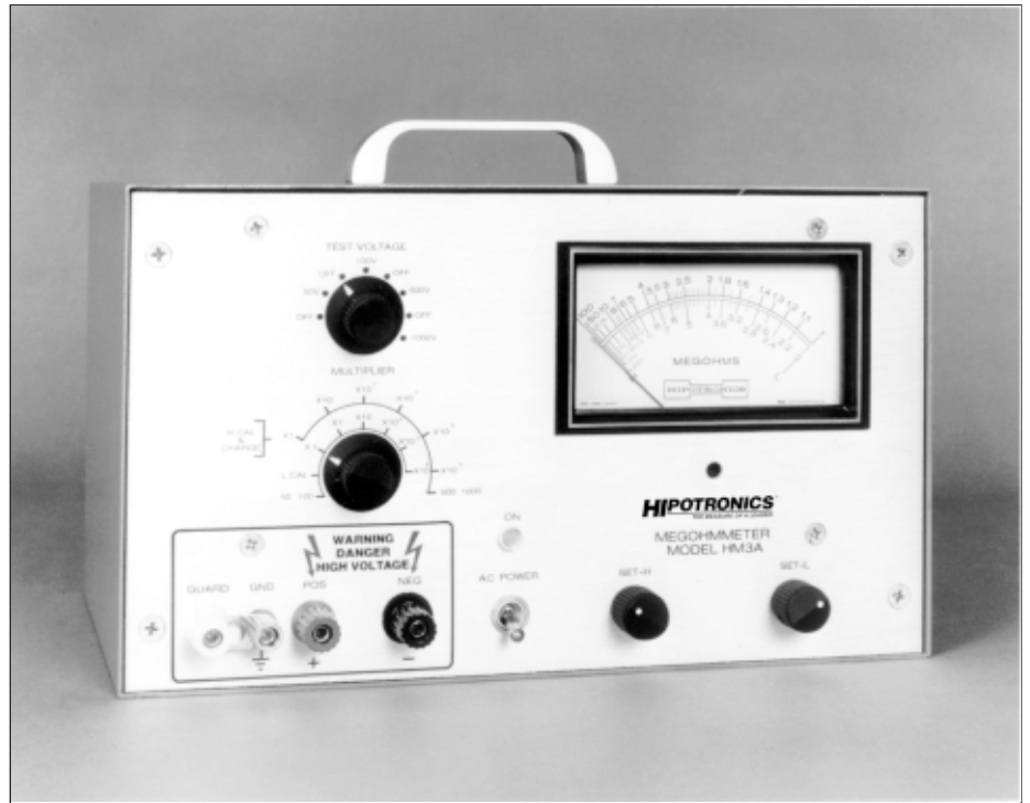
Model HM3A Megohmmeter